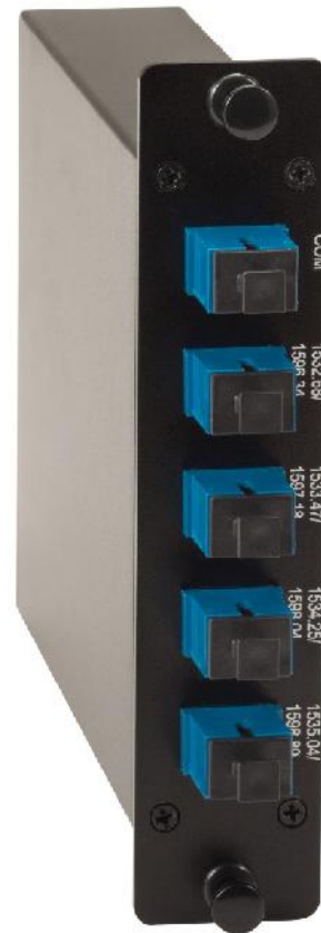
WM1 SC LGX ® Module